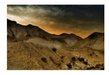
FIFTH SUNDAY IN LENT